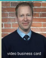
video business card